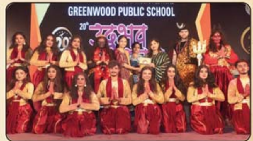
Nriyasangam - The Dance Club, MITS-DU, Gwalior (MP)