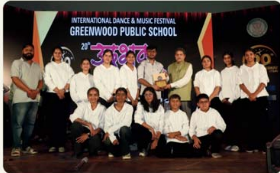
Queens' College Indore, (MP)