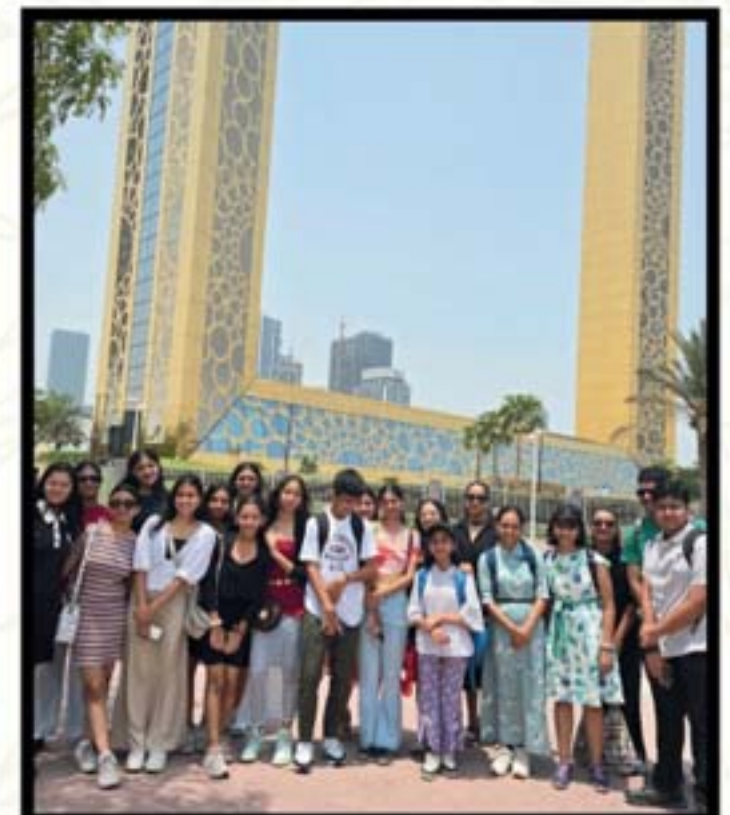
TEAM AT DUBAI FRAME