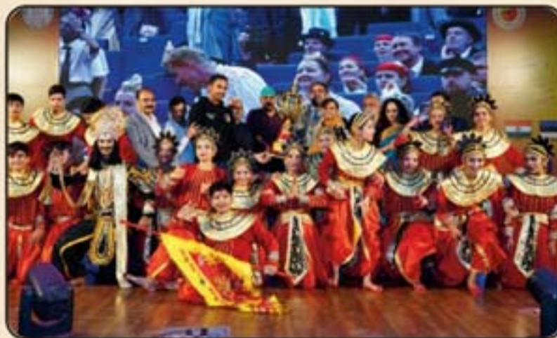
Bhartiyam Vidya Niketan, Gwalior (MP)