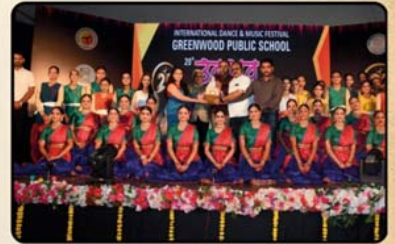
DPS Sector 45 Gurgaon, (Haryana)