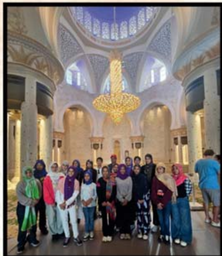
TEAM AT DUBAI MOSQUE