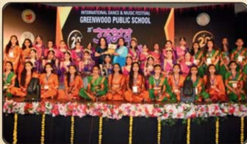
Kathak Vidhya Niketan Gwalior (MP)