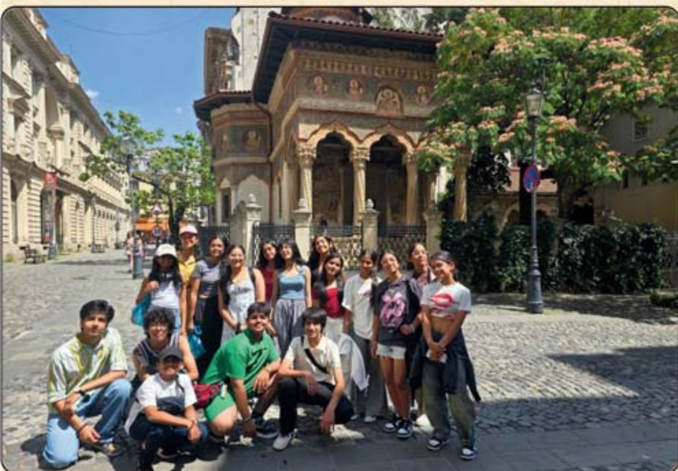
TEAM INDIA IN ROMANIA