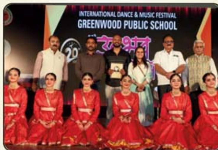
DPS International ,Gurugram, Haryana