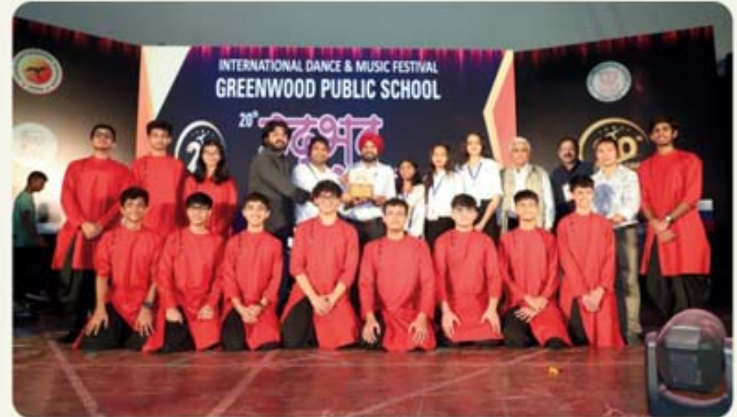
Dps Sector 45 Gurgaon (HAR)