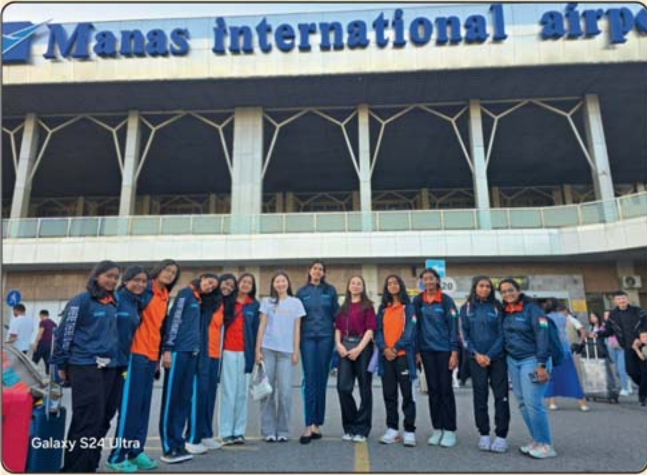
TEAM INDIA AT MANAS INTERNATIONAL AIRPORT