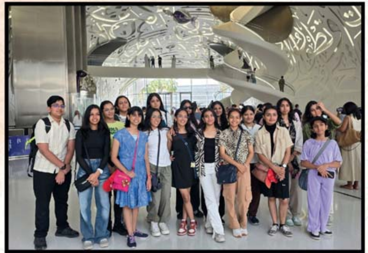
TEAM AT DUBAI - FUTURE WORLD MUSEUM