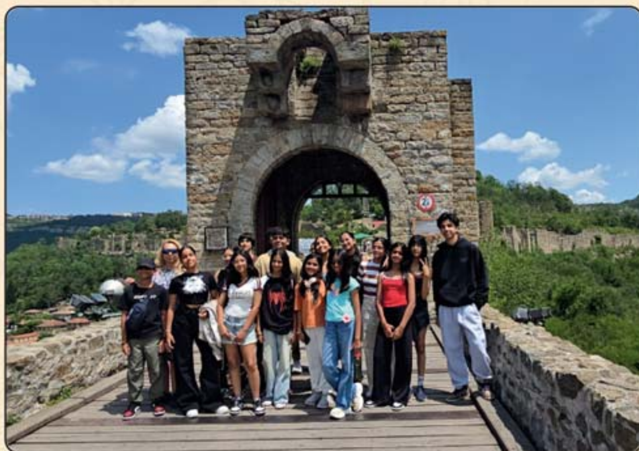
TEAM INDIA AT TSAREVETS FORTRESS