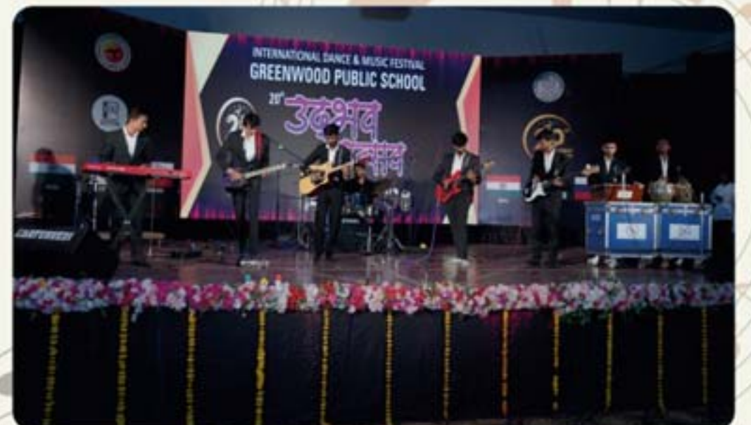
MITS, Gwalior (MP)