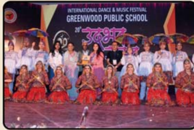
Amarchand Singhvi International School, Gandhidham, Kutch (Gujrat)