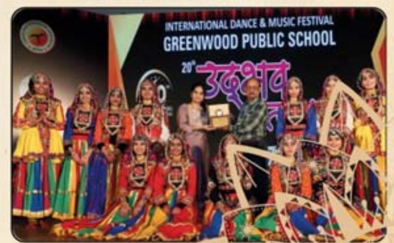
Shikha Shine Dance Academy (MP)