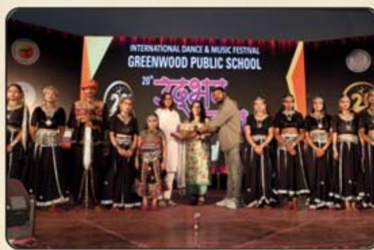
Little Wonder School, Gwalior (MP)