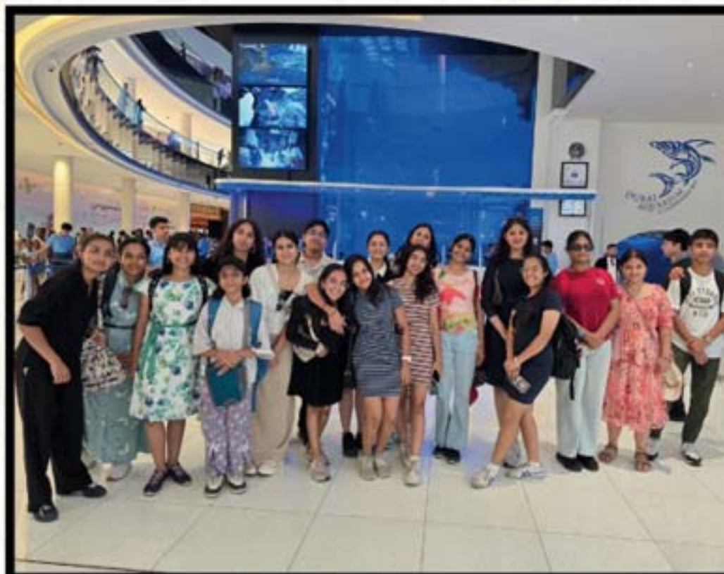
TEAM AT DUBAI AQUARIUM