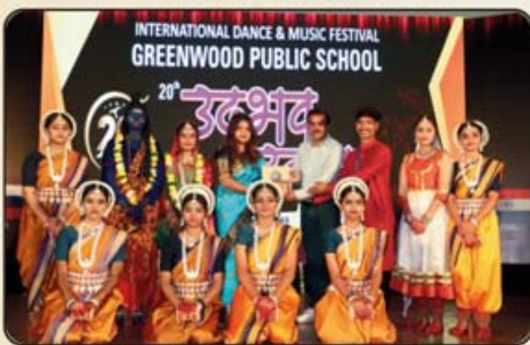
Kalyanika Kendriya Shiksha Niketan ,Amarkantak (MP)