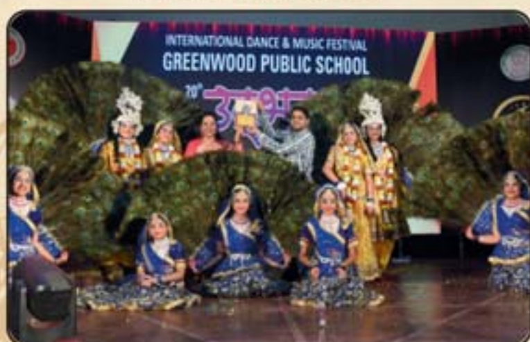
Gandharva Academy, Indore (MP)