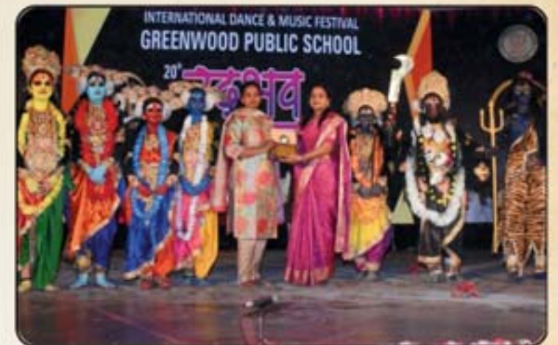
Kalarpan Dance Academy-Indore (MP)