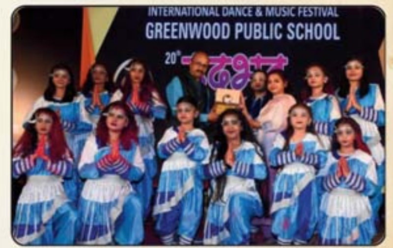
Nrityarangam Dance Academy Agra (UP)