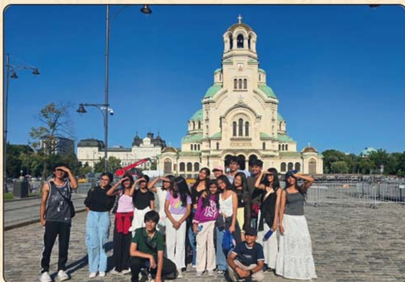
TEAM INDIA AT SOFIA CHURCH