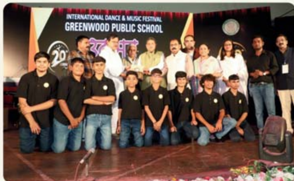
Greenwood Public School Gwalior (MP)