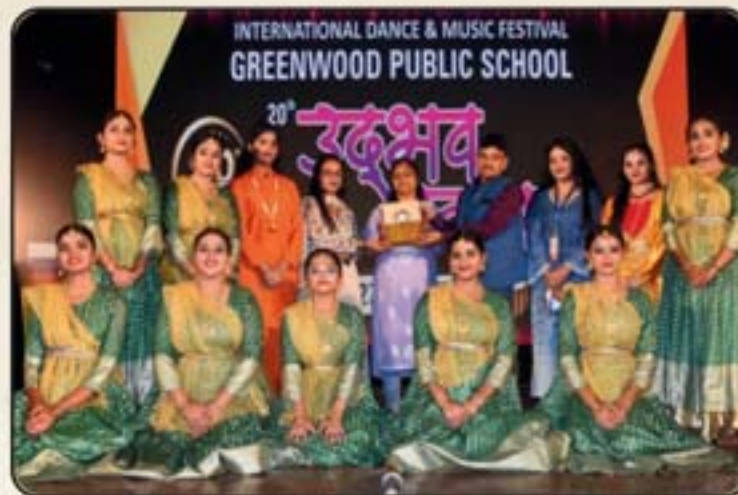
Vidya Devi Jindal School, Hisar (Haryana)