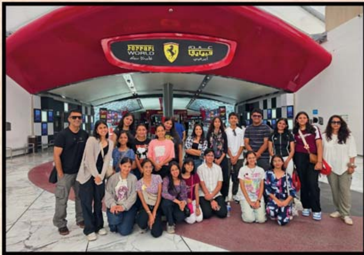
TEAM AT DUBAI - FERRARI WORLD