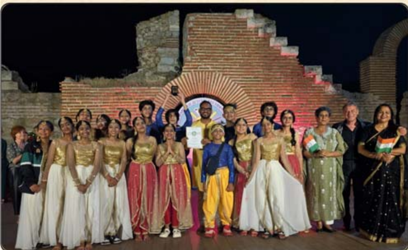
TEAM INDIA IN THE PRIZE DISTRIBUTION CEREMONY