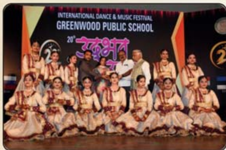
Queens' College Indore, (MP)