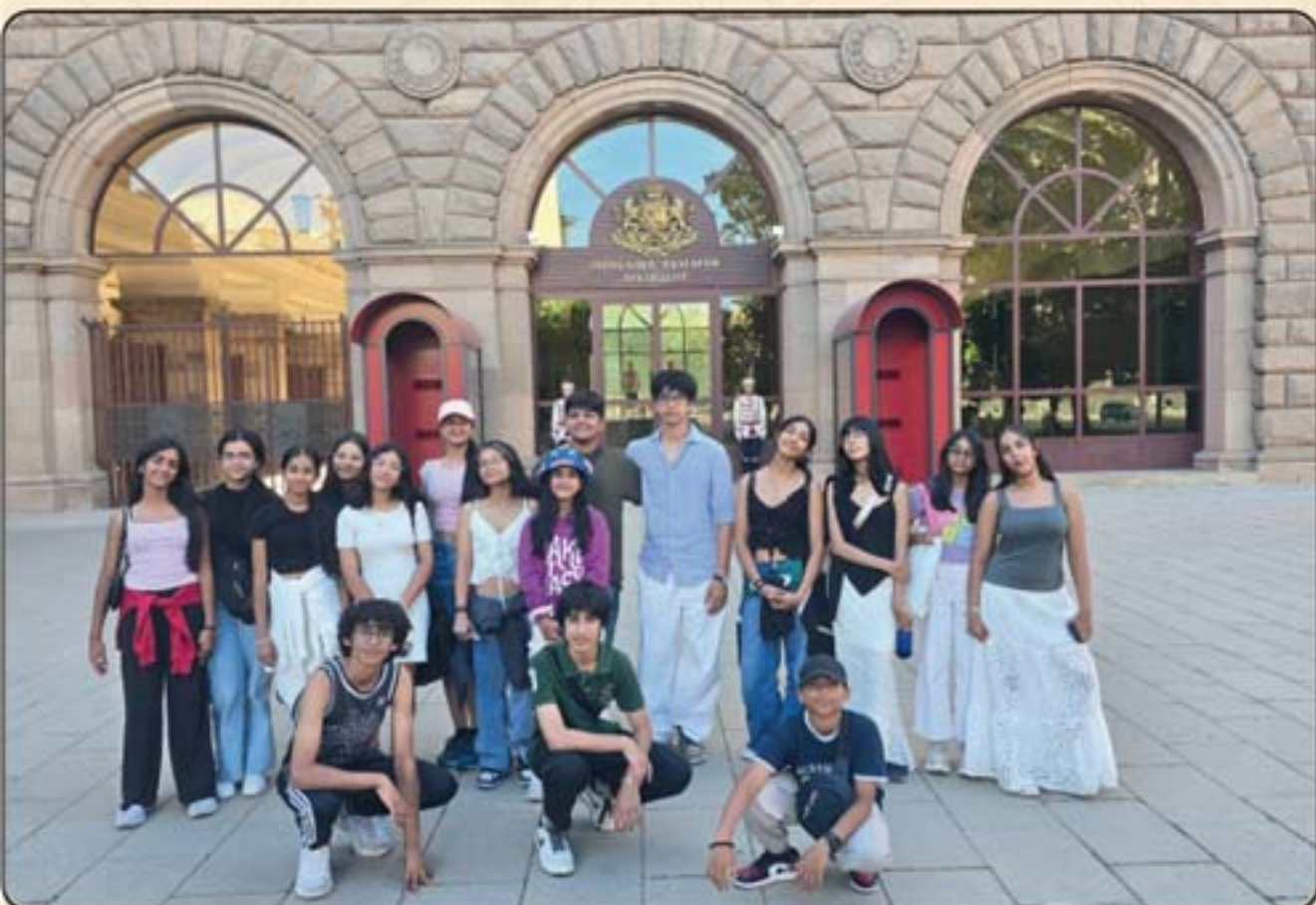
TEAM INDIA AT PRESIDENTIAL PALACE

BULGARIA - ROMANIA: DPS INTERNATIONAL ,GURUGRAM