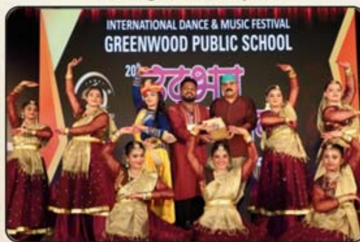
Seth Anand Ram Jaipuria School Lucknow (UP)