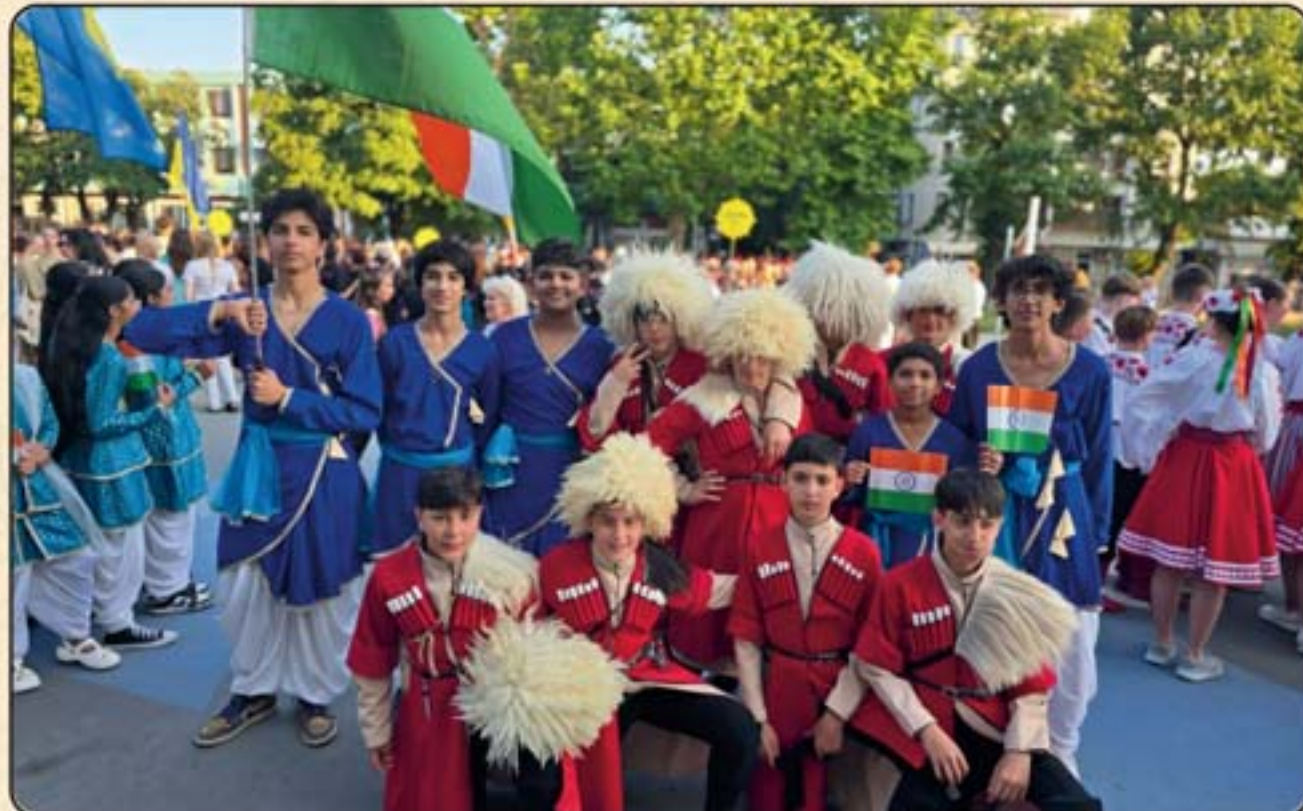
TEAM INDIA WITH TEAM GEORGIA