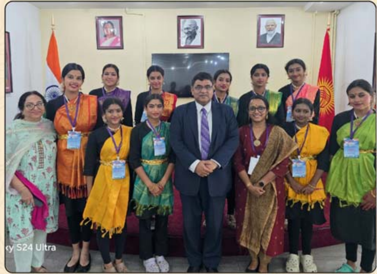
TEAM INDIA WITH AMBASSADOR OF INDIA