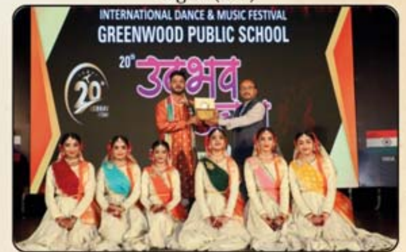
Shiv Nrithyodaya Institute of Kathak Dance - Durg (CG)